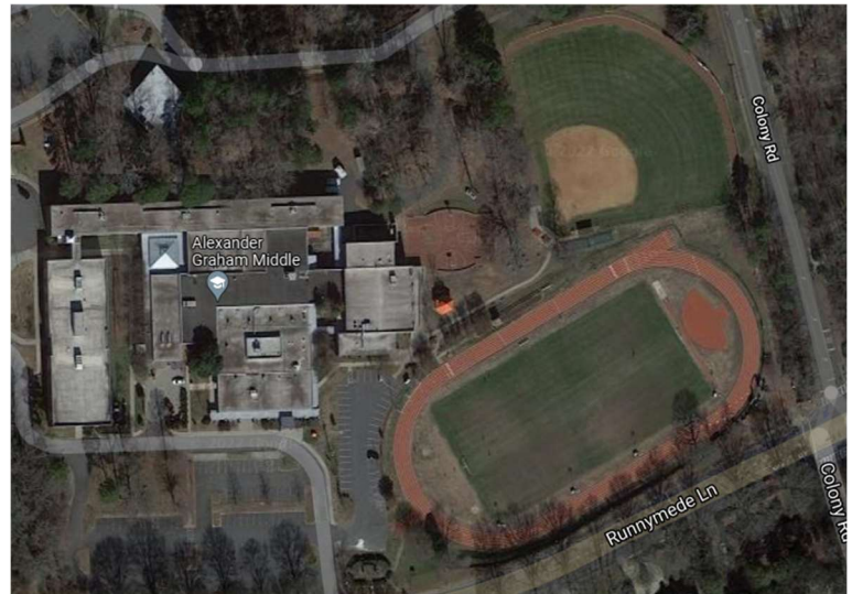
Overhead of Map of AG Middle School

This fall we will have access to the baseball field at AG Middle School. We will primarily use this field for practices; however, depending on how many teams we have, we could also use this field for some home games. The map to the right shows where the school and baseball field are located.