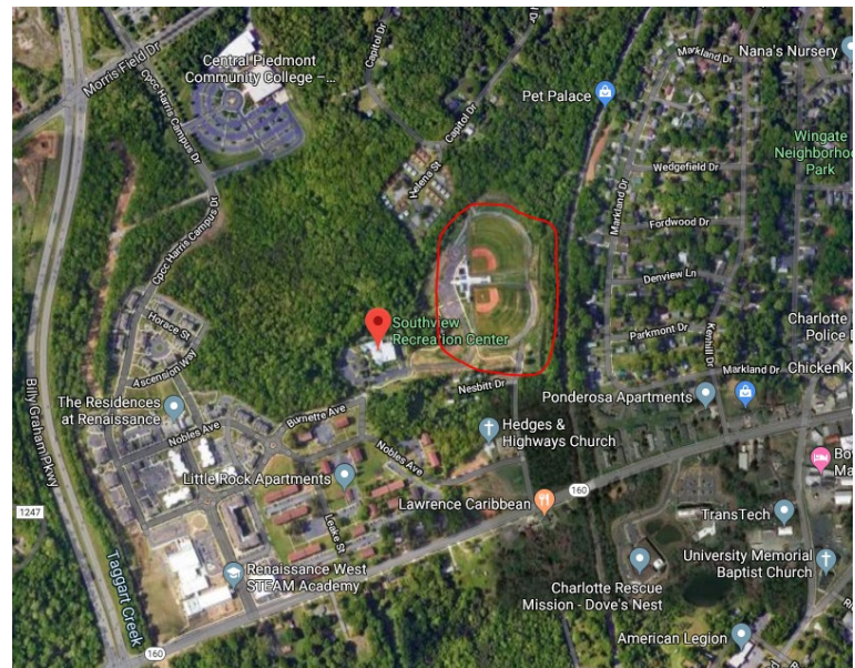
Overhead of Southview

While these fields are a little further out, they are nice and have lights. These fields will be utilized as a home field for weeknight games and will serve as practice fields for all of our Big League teams. The map to the right shows where these fields are located.