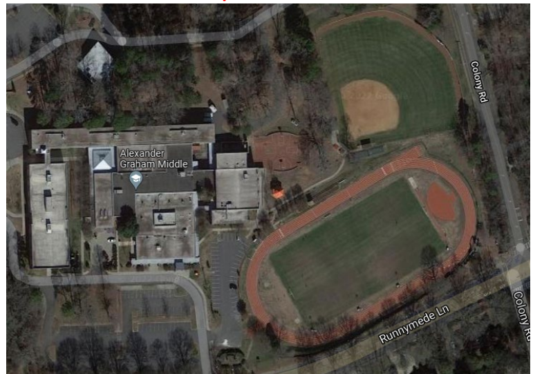
Overhead of Map of AG Middle School

This spring we will have access to the baseball field at AG Middle School. We will primarily use this field for practices; however, depending on how many teams we have, we could also use this field for some home games. The map to the right shows where the school and baseball field are located.