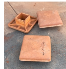
Soft Touch Base