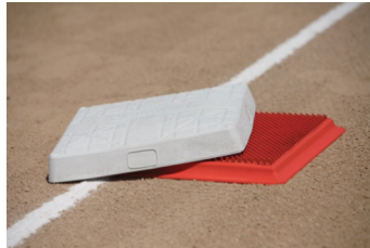
Break-away Cap and base